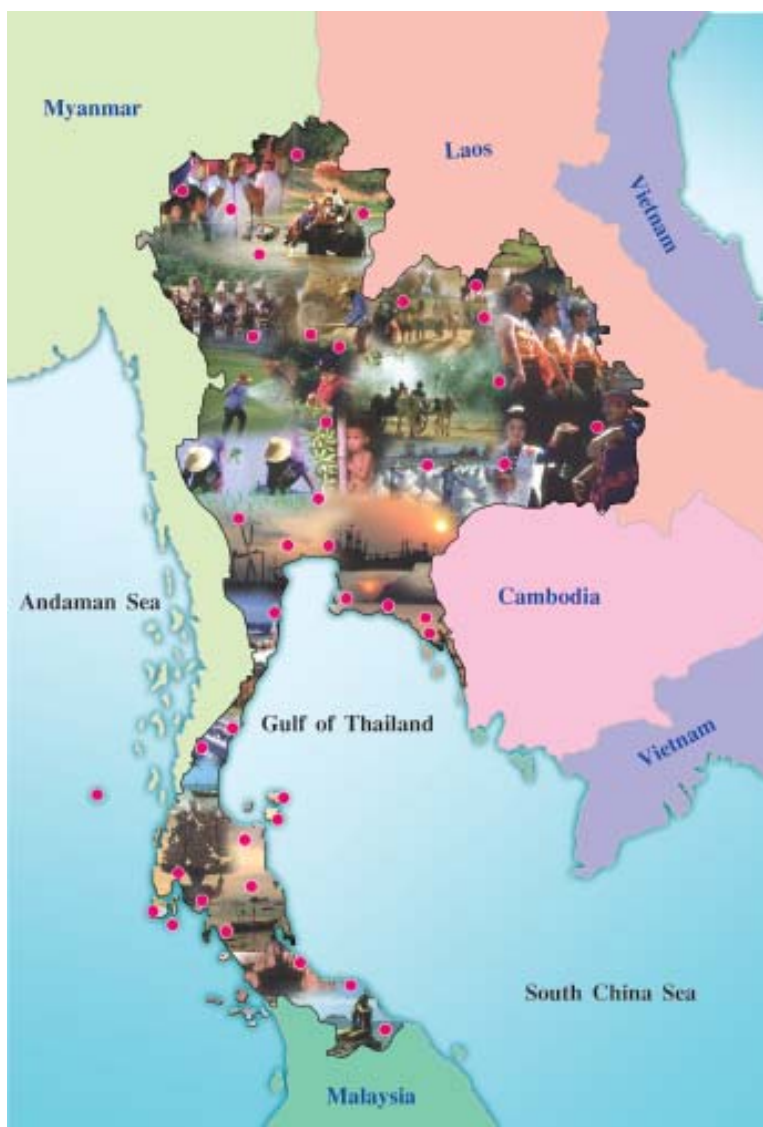
Figure 2.1 Map of Thailand

The Kingdom of Thailand is situated in the continental Southeast Asia, just north of the equator, and is part of the Indochina Peninsula (Figure 2.1).