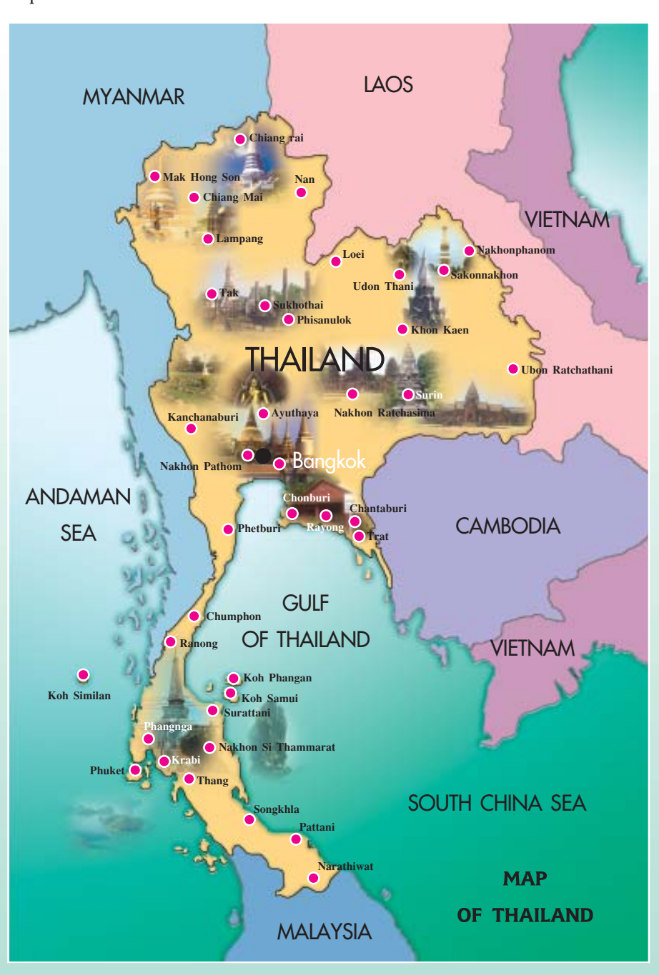
Figure 2.1 Map of Thailand

The Kingdom of Thailand is situated in the continental Southeast Asia, just north of the equator, and is part of the Indochina Peninsula (Figure 2.1).